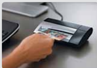
1 SCAN Patient driver's license or insurance card

CardScan IC captures sensitive patient information with ease – eliminating the need for photocopies of patient identification cards*