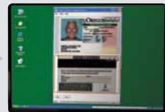
3 ADD Image to patient electronic file