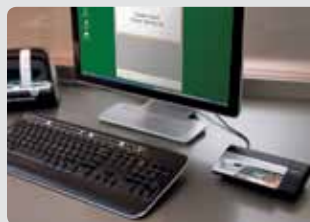
2 CAPTURE Complete image of patient card